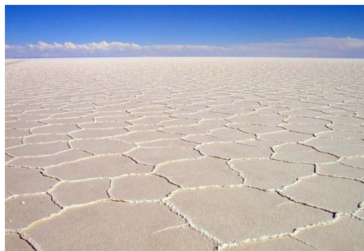
Fig. 4: Salty Polygons formation, Kashan, Iran.