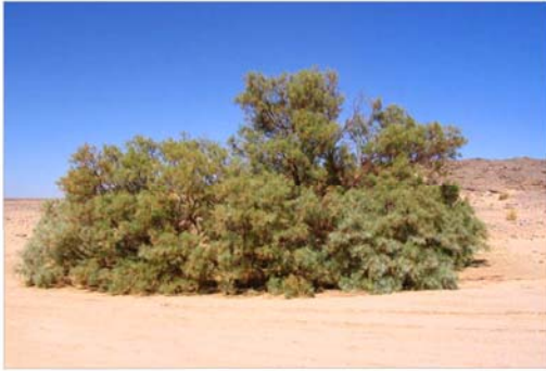
Fig. 5: Plant species of Tamarix.