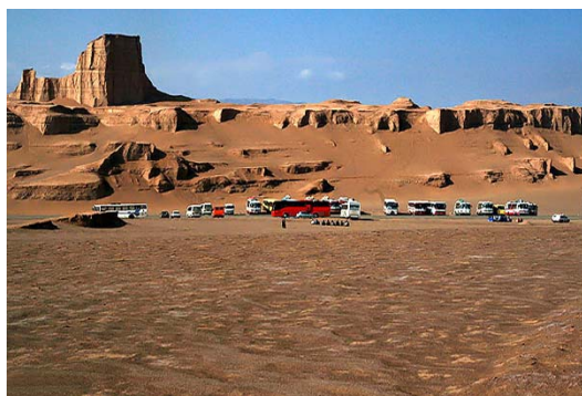
Fig. 3: Yardang formation, Shahdad, Iran.