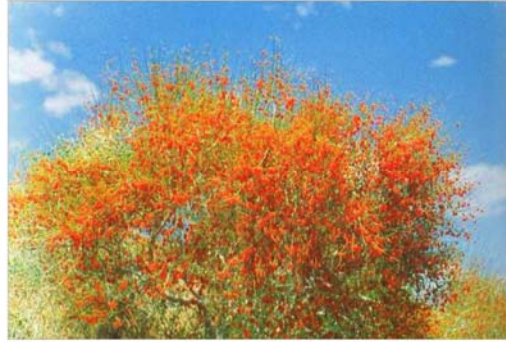
Fig. 6: Plant specie of Calligonum.