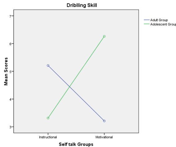
Fig. 3: Factor analysis of the effect of age and group on dribbling performance

significance of interaction showed that there is a significant difference in dribbling performance between adult and adolescent instructional self talk groups ( P \leq 0.05 ). As well, there was a significant difference in dribbling performance between adult and adolescent motivational self talk groups ( P \leq 0.05 ).