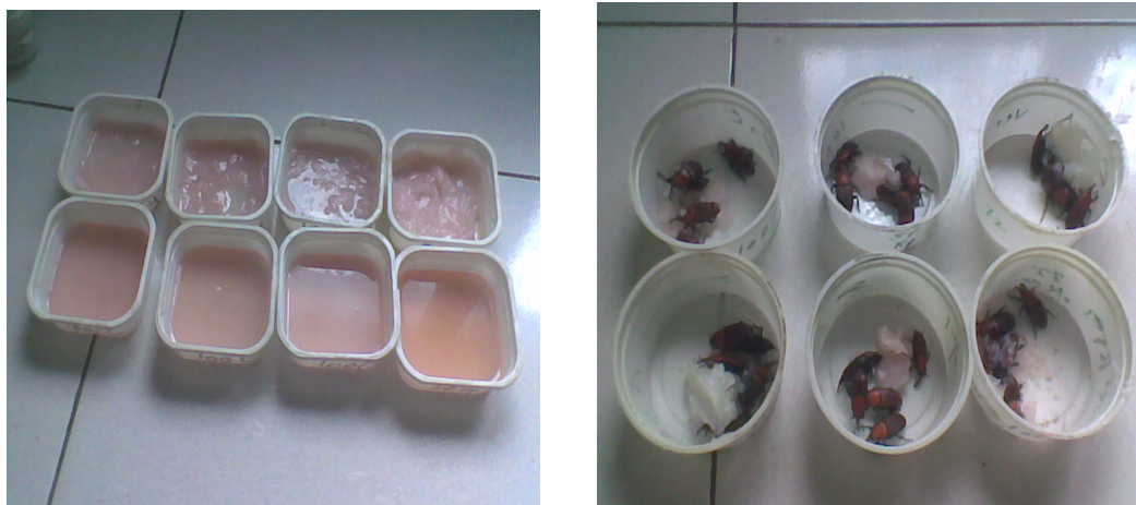
Fig 1: Toxicity of the carrier pheromone with different concentrations of the insecticide and without pesticide mixture of R. ferrugineus .