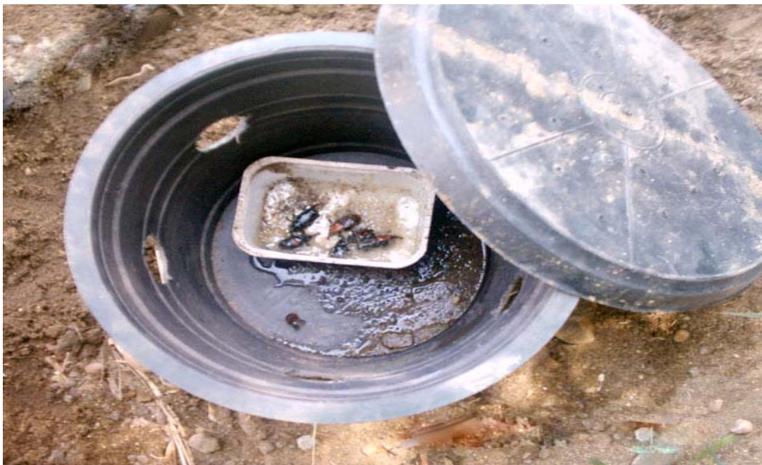
Fig. 3: Adult of red palm weevil captured.