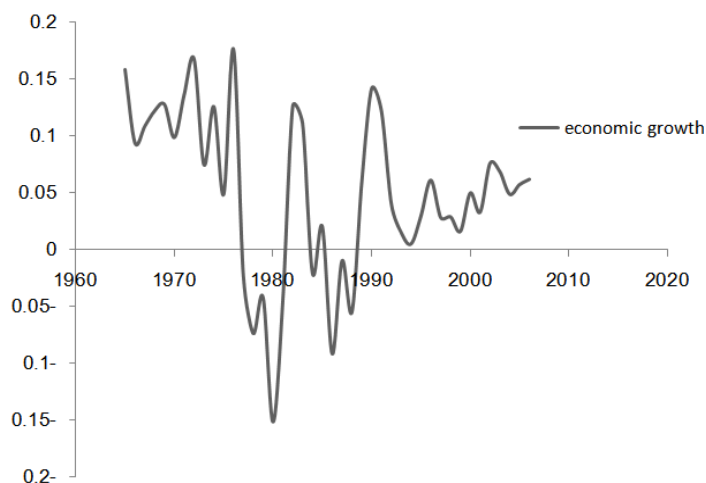
Fig. 1: Economic Growth Plot.

The 1979 revolution clearly represents a breaking point in the money-inflation relationship. Inflation increased significantly following the revolution (from 6.6 percent to 17.4 percent on average), but the acceleration in money growth was almost negligible (from 23.8 percent to 24.6 percent on average). 2 After the dramatic increase experienced in the mid-1990s, when it reached a peak of 50 percent, inflation declined up until the first quarter of 2006/07, though the annual average remained in the double digits. This decline, however, did not reflect an improvement in monetary control, as both M1 and M2 continued to grow quite rapidly. The divergence in the behavior of inflation and monetary growth in recent years is reflected in the performance relative to the inflation target and the money growth target set by the Five-Year Development Plans (FYDPs). (Bonato(2008)).